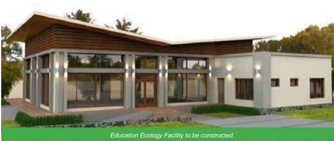
Education Ecology Facility to be constructed