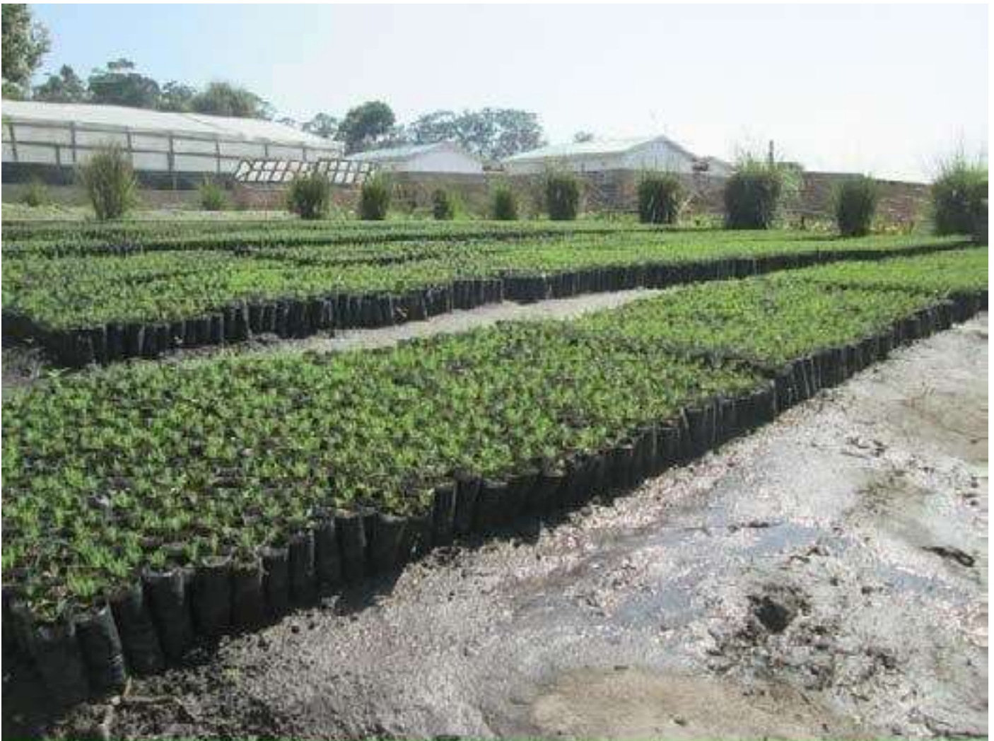
Pine nursery seedlings at Model Farming Training Centre

LIFE (Ireland) continues to support the Model Farming Training Centre as it plans to build a hostel to accommodate the trainees while they are at the Model Farming Training Centre. The same hostel will be used to accommodate visitors or groups who wish to spend time at the Laudato Si Centre (The Green Zone).