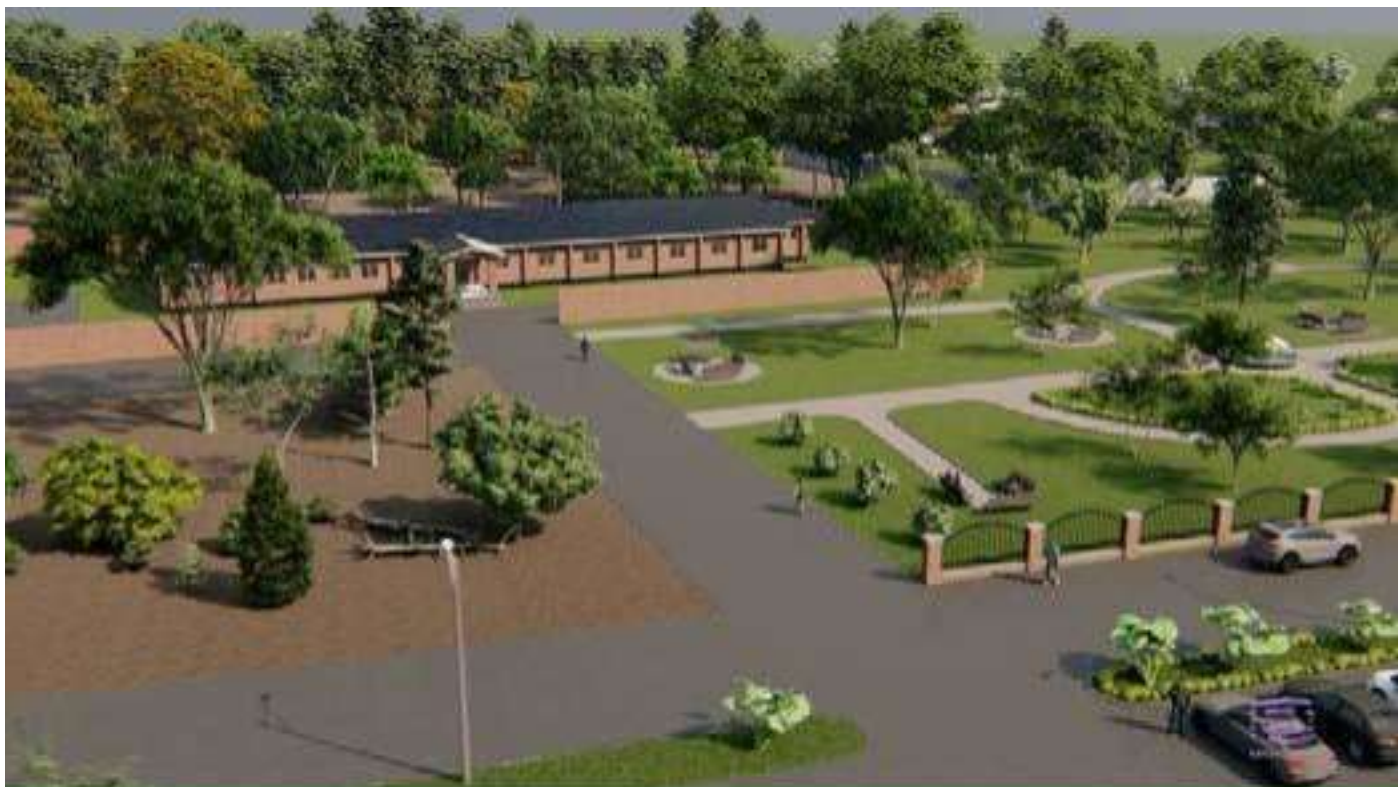
A proposed Recreation Park in front of Jobidon House

Other recycling ideas will be researched with a view to further training and community involvement.