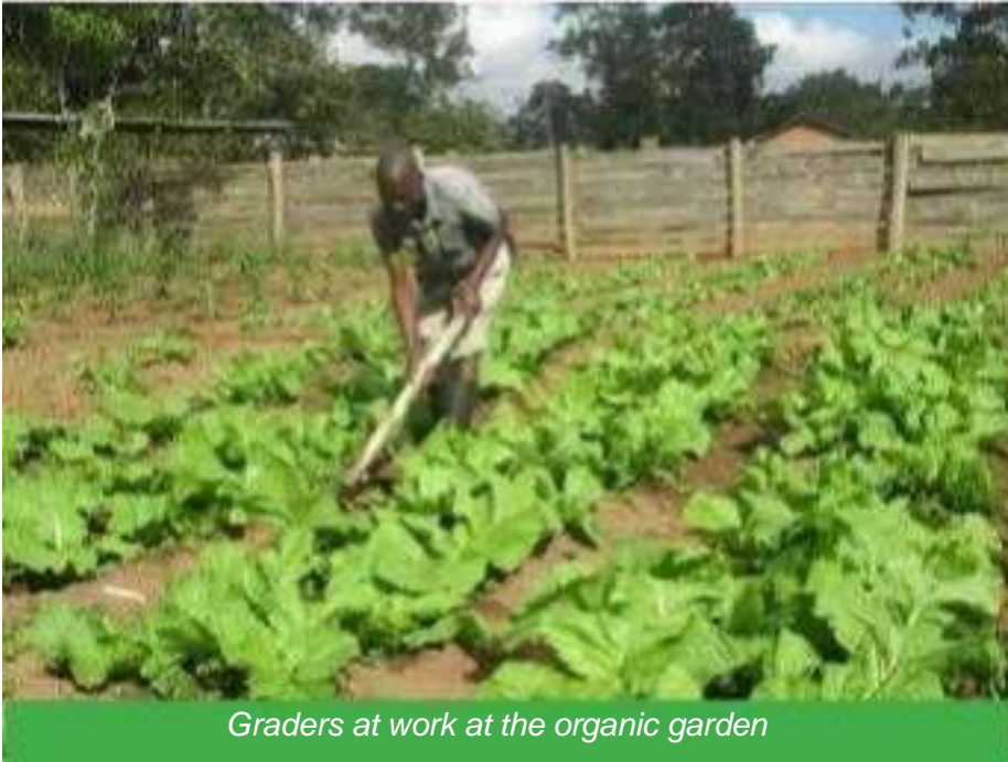
Graders at work at the organic garden

As part of our commitment to getting rid of pesticides and chemicals fertilisers that have been in use for so many years, we have set aside a piece of land for organic gardening only. The Bishop has encouraged us to also set aside another piece of land for an organic orchard. This initiative is being funded and supported by the community that lives with the Bishop at Marcel House. As mentioned earlier, those taking the education tour will pass through this garden in order to be made aware of the importance of organic gardening.