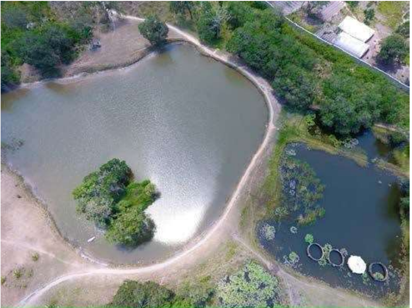
Overview of some forest area and dams

These efforts of the early Missionaries turned the plot into a good source of natural water and an attractive environment where a lot of natural wild life thrived. The refreshing breeze and attractive surroundings became a beauty to behold – a legacy left behind by the first missionaries from the 1940's through to the 80's, mainly the Missionaries of Africa.