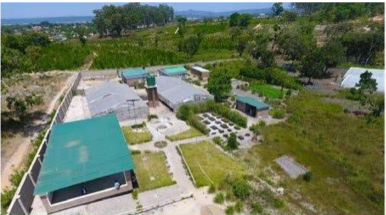
Model Farming Training Centre

their local communities. The areas in which they trained (and are now engaged in passing to others) are - forest management, manure making, organic farming, tree nursery establishment, village savings and loans, energy cooking stoves, vertical garden, bee keeping and modern methods of sustainable farming. Given the success of these present trainings, the plan is to bring in more people from the parishes and repeat the training cycle.