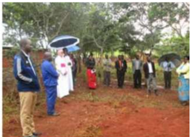
Bishop John in some of communities encouraging planting of trees