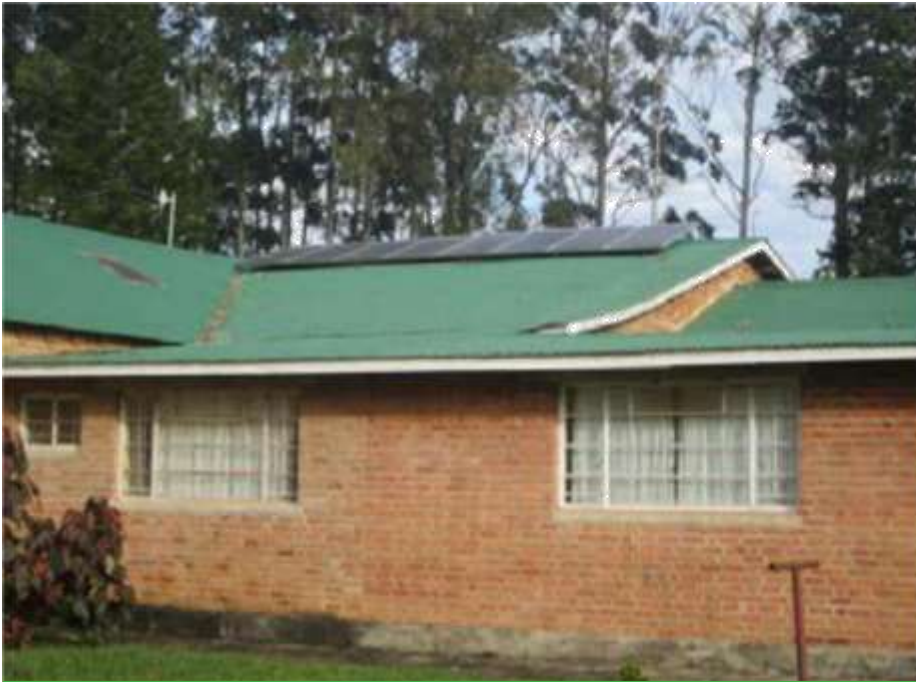
Solar Panels used for pumping water