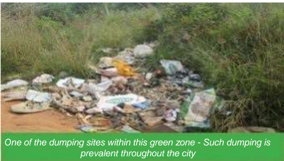
One of the dumping sites within this green zone - Such dumping is prevalent throughout the city

The infrastructure development as a result of timber demand is also a challenge in Mzuzu city. Deforestation has caused land degradation resulting in soil erosion. This has led to an