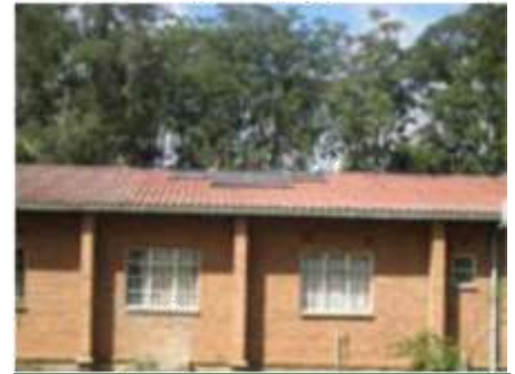
Top - Solar Powered Batteries, inverters and solar pannels (bottom) at the Diocese Secretariate

their local communities. The areas in which they trained (and are now engaged in passing to others) are - forest management, manure making, organic farming, tree nursery establishment, village savings and loans, energy cooking stoves, vertical garden, bee keeping and modern methods of sustainable farming. Given the success of these present trainings, the plan is to bring in more people from the parishes and repeat the training cycle.