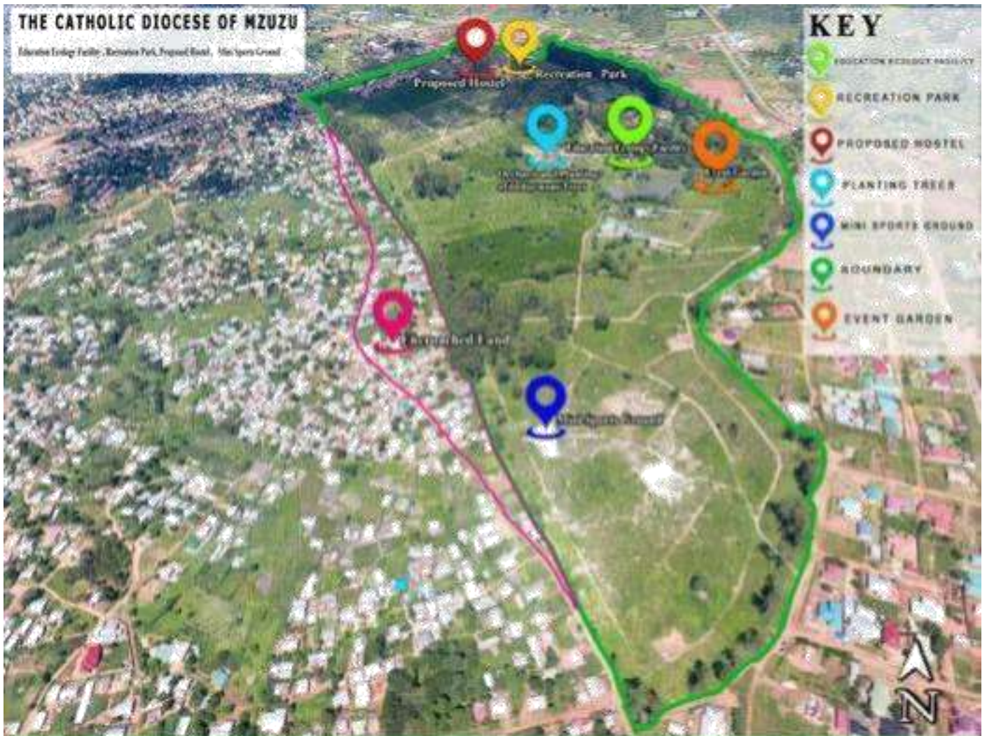
The overview of the original boundary of the green zone and the encroachment that has happened