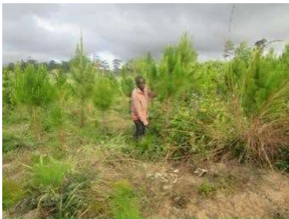
A worker pruning the new trees

When the pine and blue gum trees that were planted by the missionaries came to maturity, the Diocese began a timber project which was aimed at milling the trees. This was a source of revenue for the diocese (e.g. Enabling it to procure vehicles for use in pastoral work). In order to maintain the valuable legacy, a reforestation project was also embarked upon. The aim of this was to replace the harvested blue gum and pine trees with indigenous trees. The Diocese has also been implementing other forest-related management activities such as the establishment of fire breaks, pruning of trees, weeding and inspecting the growth rate of the planted trees.