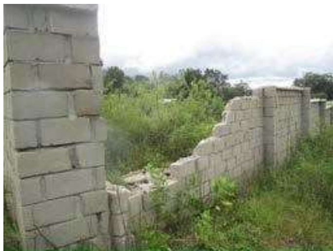
Vandalism at Model Farming Training Centre

Over the past number of years, the diocese has registered an increase in property damage. Some examples are - Removal of supporting poles around Marcel house garden; vandalism of Model Farming Training Centre fence and the pump house; digging across the property by communities in search of roots for firewood.