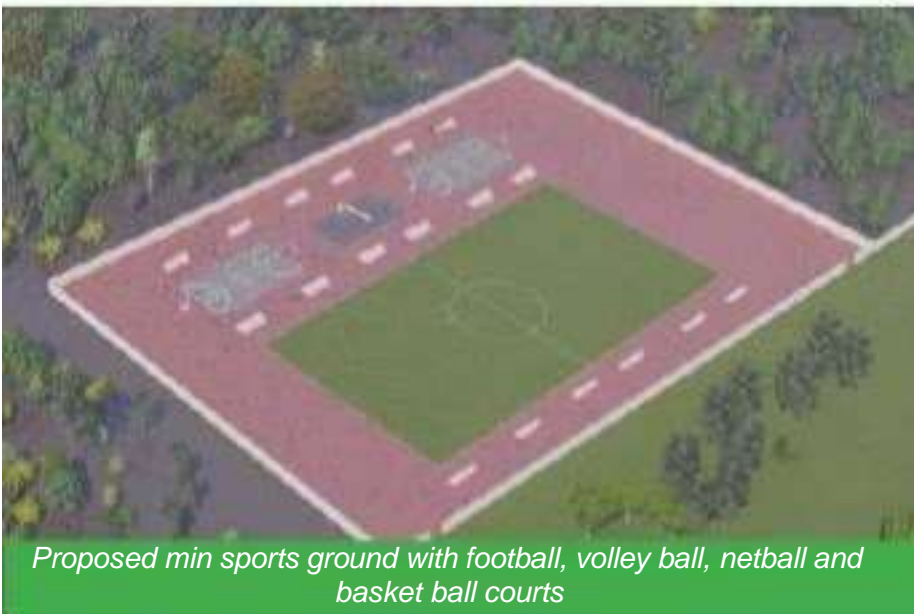
Proposed min sports ground with football, volley ball, netball and basket ball courts

The Diocese has designated land to develop a mini sports ground and a recreation area. The mini sports ground will address the needs of the children from the community by providing a football pitch, netball court and basketball court, all of which will be constructed on land gifted by the diocese.